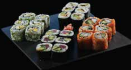
SAN (THREE) (F), (D) Dragon roll, spicy tuna maki, crispy lobster, California roll