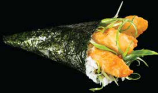
TEMPURA SHRIMPS (F), (G) Scallion