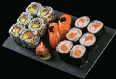
ICHI (ONE) (F), (N), (D) Salmon nigiri, rainbow maki, salmon fantasy