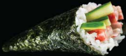
CRAB (F) Cucumber, mint