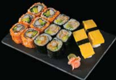
NI (TWO) (F), (D), (G) Tamago nigiri, shrimp maki, California roll