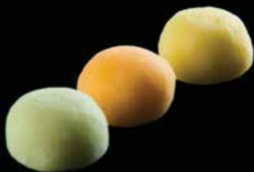
MOCHI ICE CREAM SELECTION (D), (N)