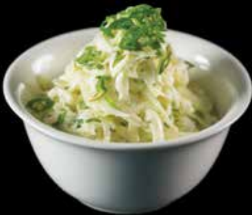
REMOULADE WITH WASABI MAYO (D)