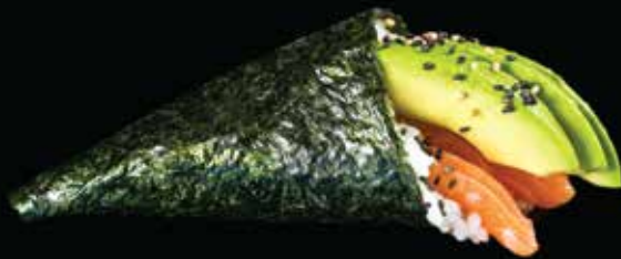
SALMON AVOCADO (F)