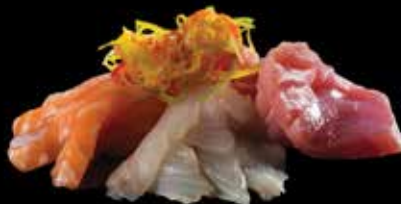
ASSORTED SASHIMI (F)