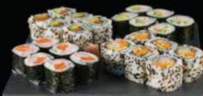
SHI (FOUR) (F), (D), (G) Tiger tempura, California maki, salmon fantasy, rainbow maki