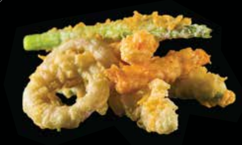
TEMPURA VEGETABLES (G)