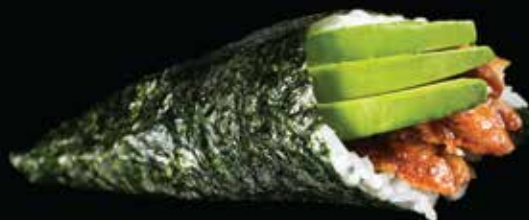
EEL AVOCADO (F)